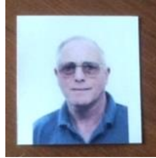
Passport pictures, then and now